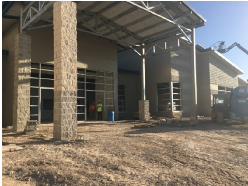
Image 1. Installation of BMU on columns 60% complete. Door and windows frames installation complete.