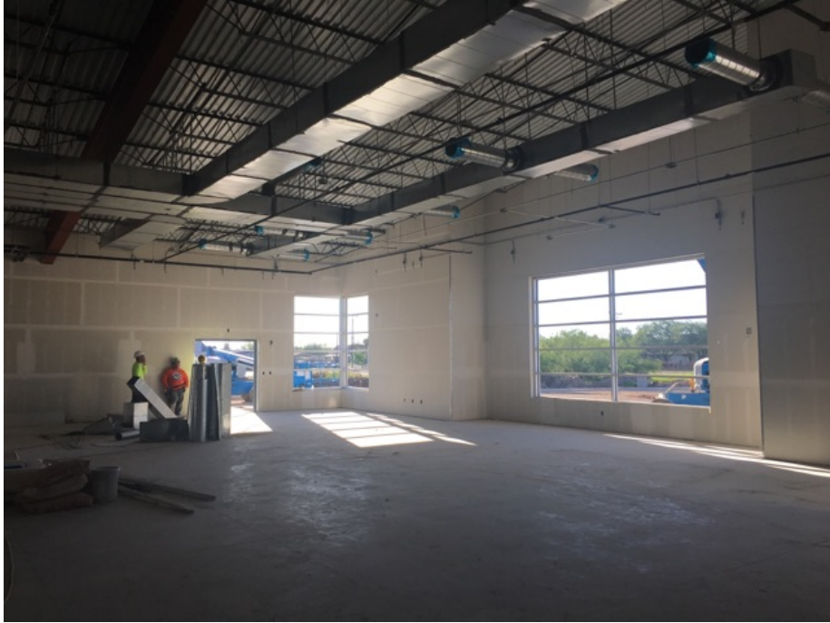
Image 4. Window frames installation complete.