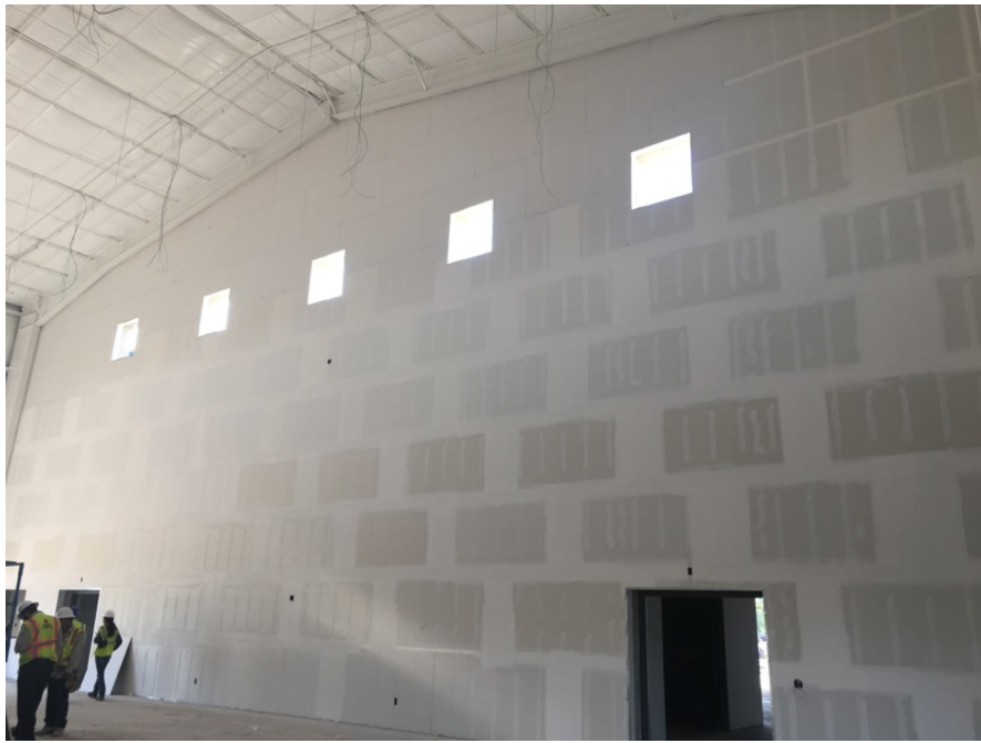
Image 5. Taping and floating installation completed.