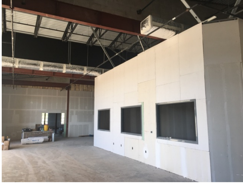
Image 2. Gypsum wallboard and insulation installation in progress.