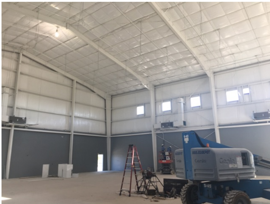
Image 6. A/C ventilation ducts installation in progress.